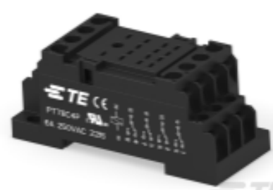
TE Part # 2071566-1 PT78C4P