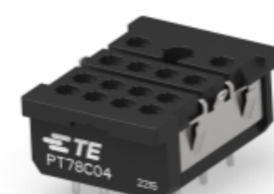
TE Part # 2071566-5 PT78C04