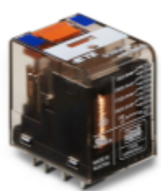
TE Part # 9-1419111-3 PT571024