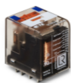
TE Part # 4-1415357-1 PT521048

Also in the Series | SCHRACK Miniature Relay PT